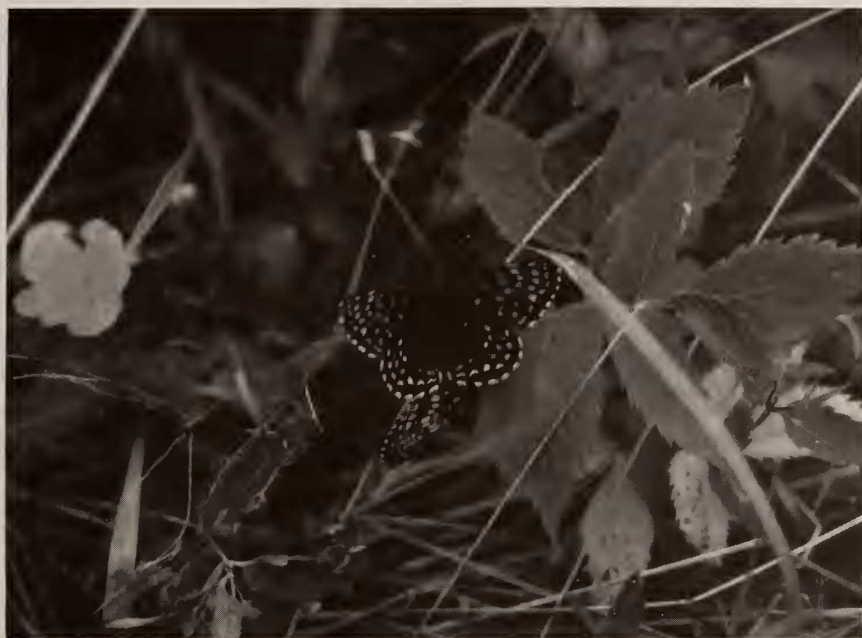
Fig. 1. A mating pair of Melitaea diamina .